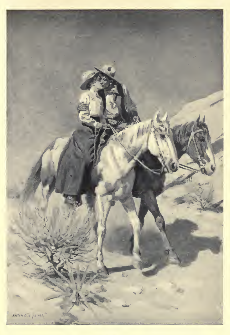
She struggled weakly to free herself, and his clasp only tightened jealously. Page 134.